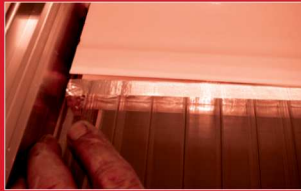
5 Install glazing