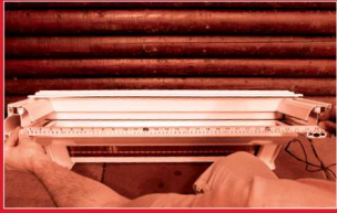
1 Measure bar to bar