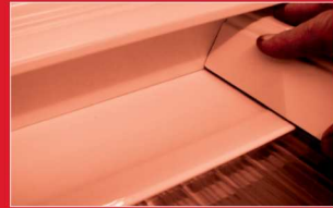
6 Install cappings