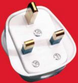
Plug and Go