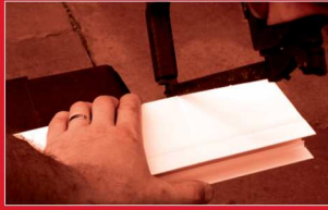
2 Adjust size if required