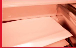
3 Install Vertex