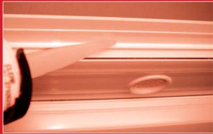
4 Silicone for glazing