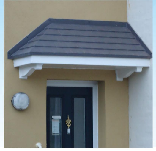
Right-handed with Small Decorative Legs